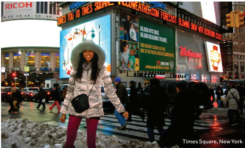
Times Square, New York

"Best year of my life!!!! I would recommend an exchange to everyone and recommend Vancouver/Whistler even more! I think every student should do one!"