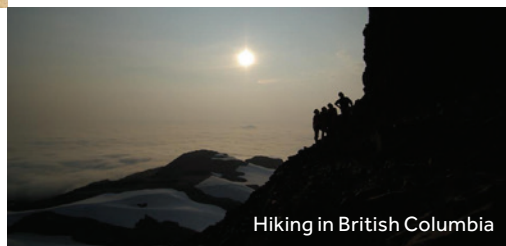
Hiking in British Columbia