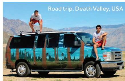
Road trip, Death Valley, USA

"I secured an international summer internship as a Social Media Associate at BKV marketing agency in Atlanta. I gained a greater understanding of American business and will be applying to graduate roles in marketing next year."