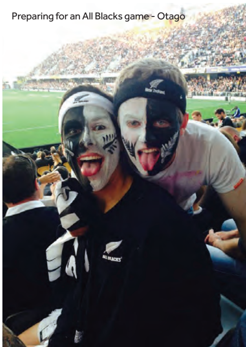
Preparing for an All Blacks game - Otago