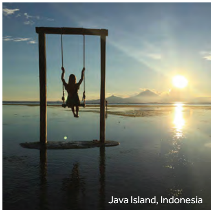
Java Island, Indonesia

“Some people make their kids do sports or music - I’ll be forcing mine to go on exchange so they can experience the exhilarating, spontaneous, addictive experience that is a year abroad!”