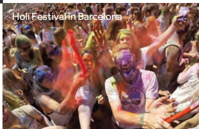
Holi Festival in Barcelona