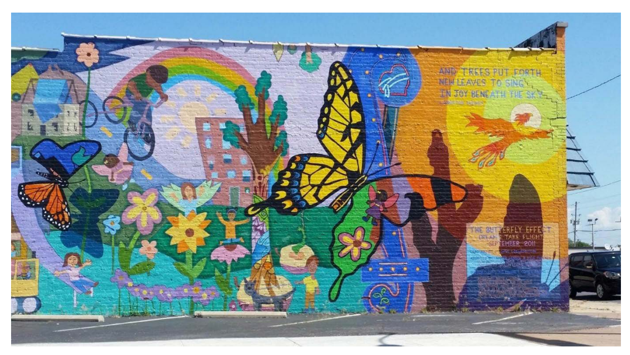
Figure 1: The Butterfly Effect by Dave Loewenstein is a public mural commemorating the violent EF-5 Tornado that struck Joplin, Missouri, in 2011.

Following the tornado, many child survivors reported that butterfly people protected them from the effects of the tornado (Rowland 2021). When Loewenstein asked local children to draw pictures to be included in the mural, many drew butterflies, which he incorporated into the design. In this way, the mural honours and preserves the collective memory, especially the experiences of children affected by the tornado, while also allowing individuals to interpret the meaning based on personal systems of belief. For some, the butterfly people represent Christian depictions of angels while for others they serve as a non-religious reminder of the strength of the community. Public art may act as an important medium for COVID-19 remembrances as it allows for the collective remembering of the shared tragedy while also accommodating individual and personal experiences of loss.