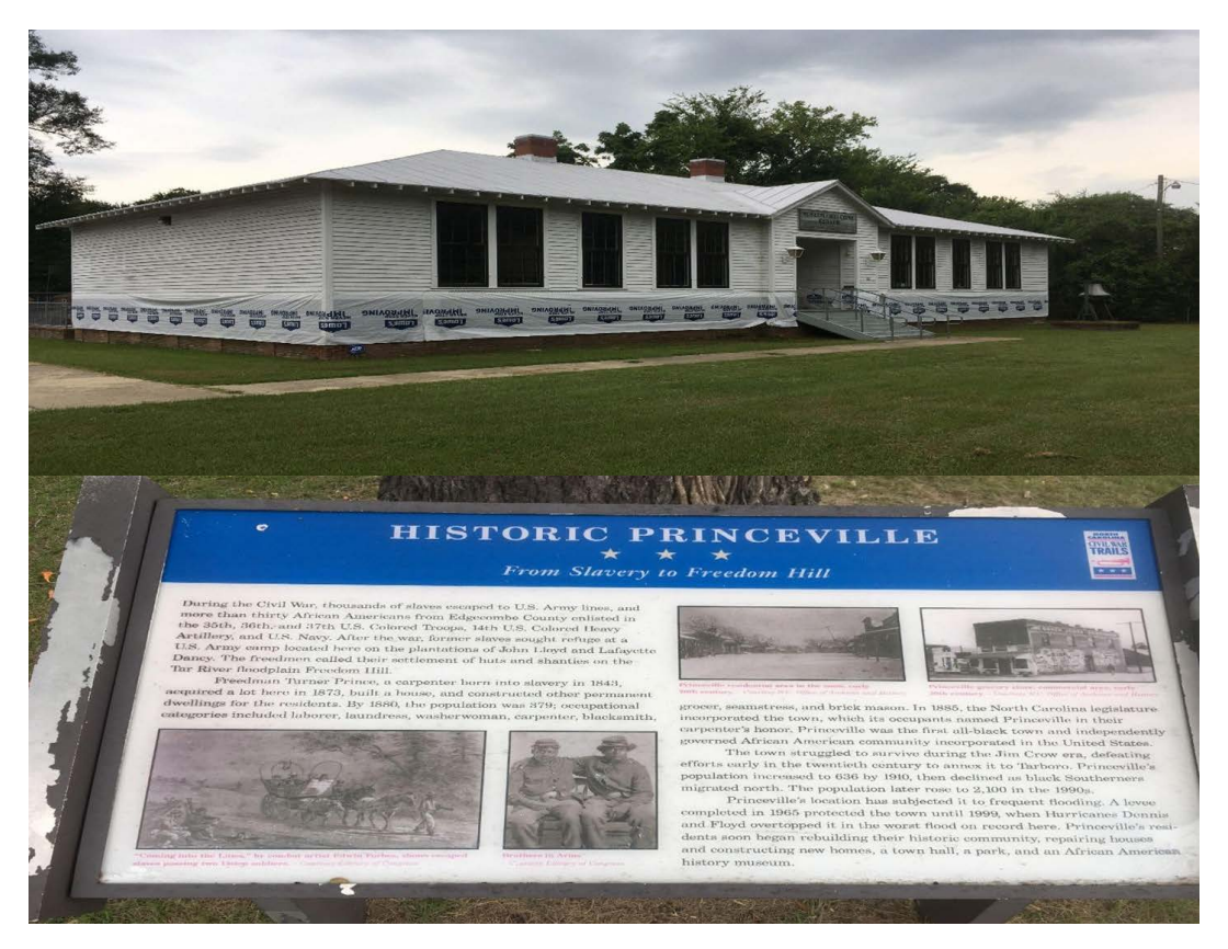
Figure 4: A historic schoolhouse-turned-museum (above) and educational signage (below) scaffold an intergenerational story of resilience retold by community members in Princeville, North Carolina. The town has been severely impacted by flooding from Hurricanes Floyd (1999), Matthew (2016), and Florence (2018), plus seven other floods before 1965.

Local context is important here. In contrast to majority black Princeville, the much larger neighboring town of Tarboro lies outside the floodplain and is majority white. Therefore, the historical links made in the signs publicly acknowledge how racial and other social inequities have perpetuated losses in the community. In doing so, they legitimize the collective minority experience for present and future generations.