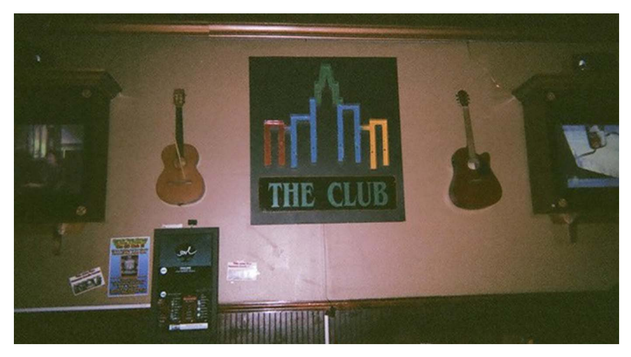
Figure 2: Section of a memory wall in a privately-owned Gulfport, Mississippi, nightclub. The wall was created to aid recovery from Hurricane Katrina, which devastated the region in 2005.

Similar shows of artistry can be seen in the memory walls erected in public or private settings during disaster recovery. These nostalgic collages of cherished belongings and/or photographs can be assembled to remember specific people, social communities, or vibrant gathering places lost to tragedy. Whether ephemeral or long-lived, these displays facilitate grief work for individuals while also supporting community healing and unification on a collective level. After Hurricane Katrina, we observed a memory wall emerge in a Gulfport, Mississippi, nightclub that was destroyed and later rebuilt. This memory wall contained several guitars, cracked plates, faded record covers, old photos, and a damaged sign salvaged from amid the hurricane debris: